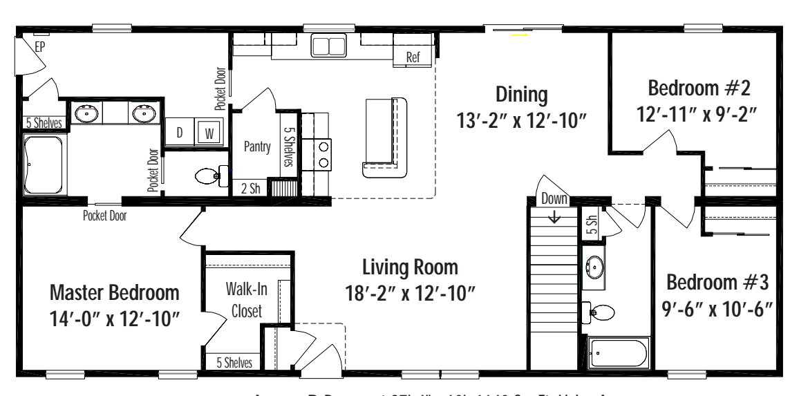
Logan D Basement 27'-4" x 60', 1640 Sq. Ft. Living Area

Floor plan dimensions are approximate. Artist's floorplans, elevation renderings and photographs are for illustration purposes only and may include optional features. Garages, porches and other attachments are not included unless specified in the written contract. All construction details and specifications must be written in the contract. No oral conditions.